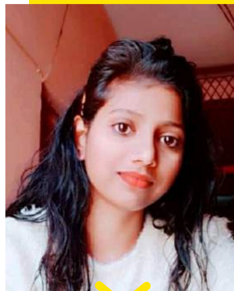
SANGEETA Riddhi Siddhi Education 10K