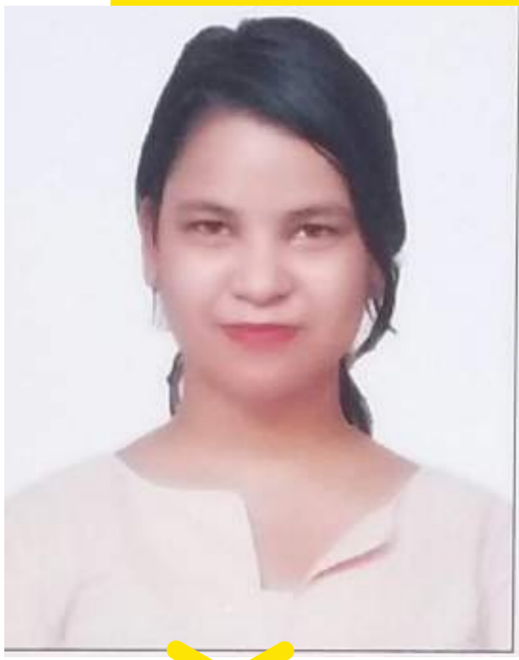
TAMANNA Riddhi Siddhi Education 10K