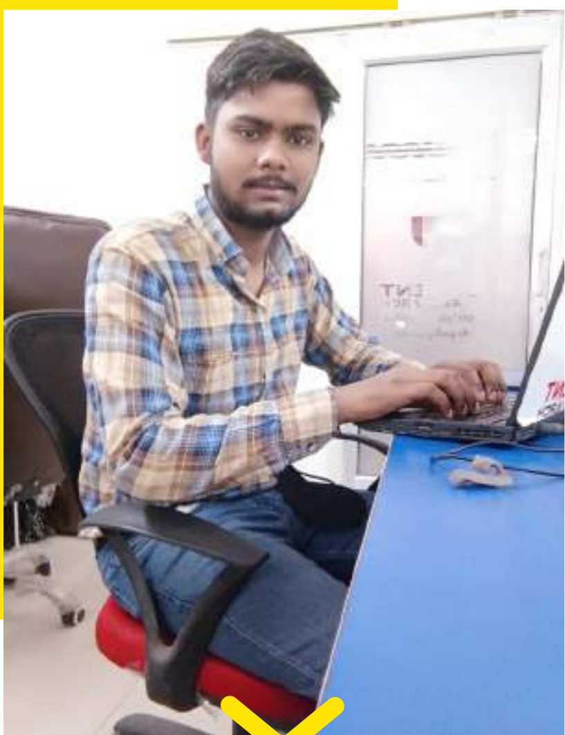
SURAJ Frequent Research Fieldworks 10K