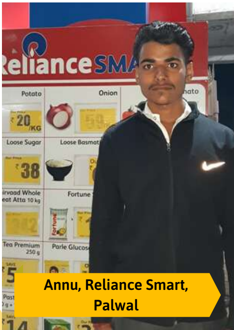
Annu, Reliance Smart, Palwal