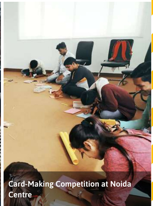
Card-Making Competition at Noida Centre