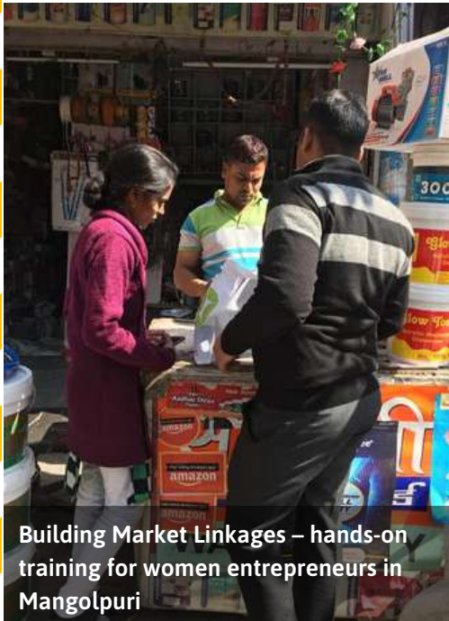
Building Market Linkages – hands-on training for women entrepreneurs in Mangolpuri