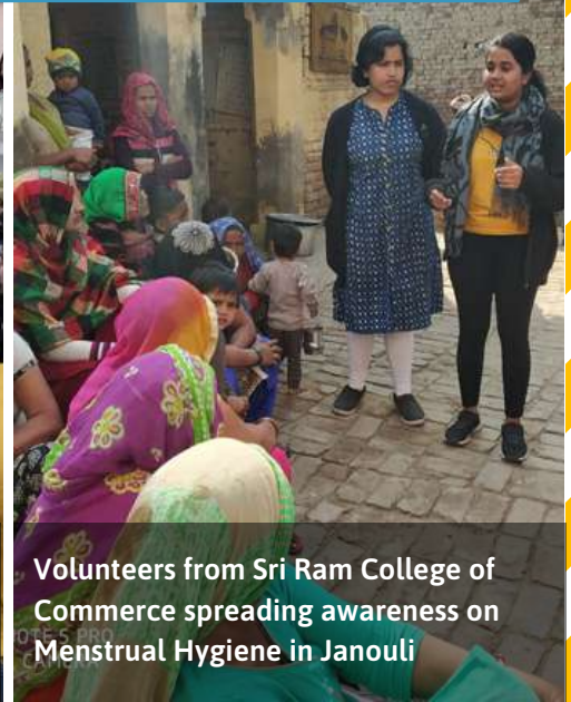
Volunteers from Sri Ram College of Commerce spreading awareness on Menstrual Hygiene in Janouli