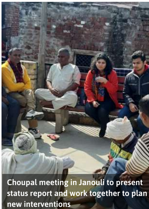
Choupal meeting in Janouli to present status report and work together to plan new interventions