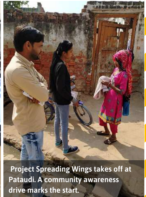
Project Spreading Wings takes off at Pataudi. A community awareness drive marks the start.