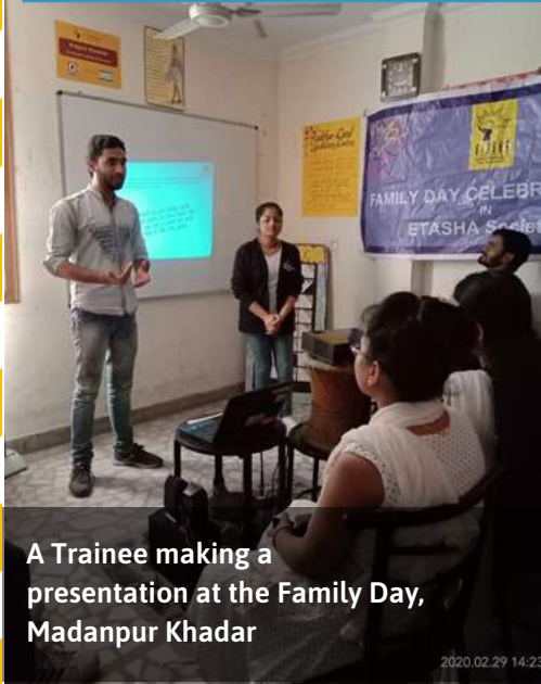
A Trainee making a presentation at the Family Day, Madanpur Khadar