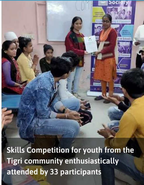
Skills Competition for youth from the Tigri community enthusiastically attended by 33 participants