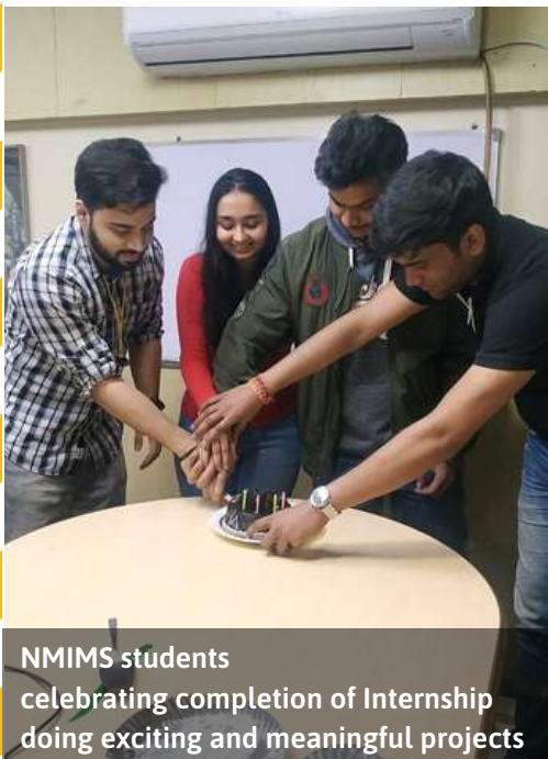
NMIMS students celebrating completion of Internship doing exciting and meaningful projects